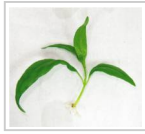
Figure 2: Representative photos of rooted plantlets: (a) control group, (b) 2.5 mM NAA treated young apical shoot microcutting, (c) 3.0 mM NAA treated old apical shoot microcutting, (d) hardening in poly bag, and (e) representative photos of matured plants grown in poly bags placed in the field under partial shade.

In comparison to YAS with OAS, it can be concluded that YAS showed the most rapid response at 2.5 mM of NAA (7.83 days) compared to OAS, which showed the quickest responses to 1.0 mM of NAA at day 9. This indicates that high dosages were more efficient for rapid rooting in YAS and low dosages were more effective for fast rooting in OAS. However, for number of roots/explants and root length characteristics, higher dosages were highly effective for both YAS and OAS. YAS produced a maximum of 25.33 roots/explant at 3.0 mM of NAA and OAS induced a maximum 20.33 roots/explant at 2.5 mM of NAA. In addition, total number of roots/explant was significantly reduced to 13.17 roots at 3.0 mM of NAA for OAS. Similarly, YAS induced the longest roots (3.31 cm) at 2.5 mM of NAA and OAS produced 3.29 cm roots at 3.0 mM of NAA. Overall, YAS was the most efficient to induce roots at the higher concentration of NAA.